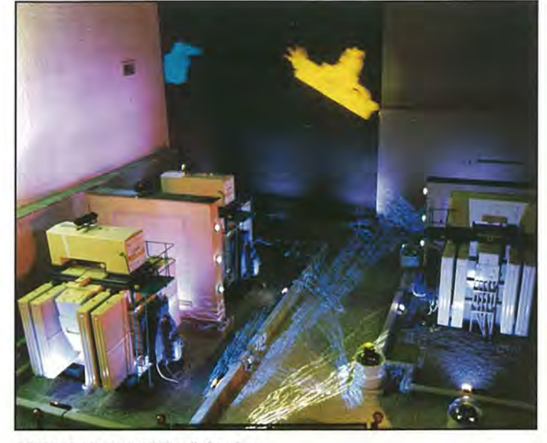
Night-time view of the light show.